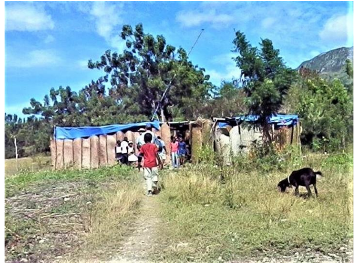
Right: The church ready for a mobile clinic

We covet your pledge of any amount for the church and school at Larot and challenge every person and church to help overwhelm them!