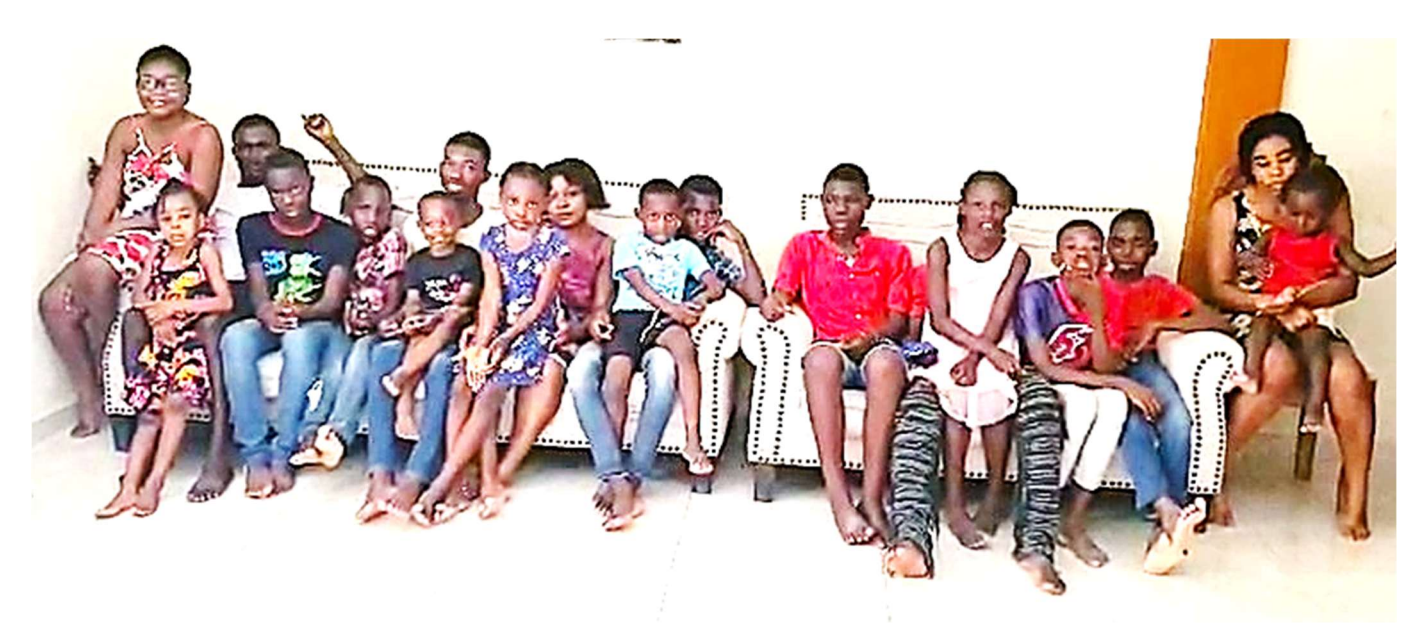
Sons & daughters of Acts 1:8 Children's Home