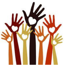
Helping this child with food and milk

Please consider becoming a monthly Ministry Partner of any amount. Your help is needed! You can set up thru your online banking system, thru our website or Facebook (see letterhead) via PayPal or text 4HAITI to 44321 and make a recurring payment. Most importantly, please remember this ministry and the Haitians in your prayers. Lives are being changed now and eternally!