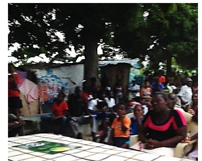
Community Bible Study